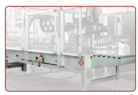
CNC CUT AND WELDED FRAME/LEGS

Maintain HSC height for separation of HSC box lids.