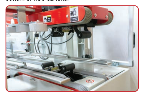
HIGH SPEED TOP & BOTTOM BELTDRIVE SYSTEM

Ensure proper separate sealing of the lid and bottom of HSC cartons.