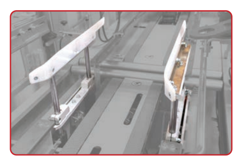
INNOVATIVE LIFTING STATION

Ensure proper separate sealing of the lid and bottom of HSC cartons.