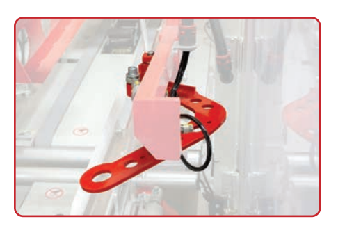
REAR MINOR FLAP SIDE KICKER

Providing you the stability and speed for high speed applications.