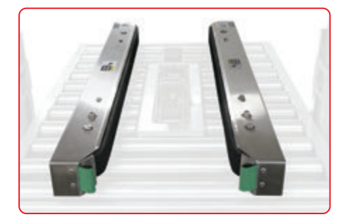
SIDEBELT DRIVE SYSTEM Gently pulls product through while reducing less wear & tear on parts.