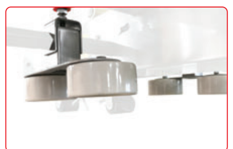
TOP COMPRESSION ROLLERS Eliminates the carton's top gap for added product security.