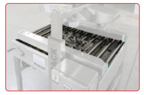
COMPLETE BED ROLLER SYSTEM Increase throughput while reducing strain on the motor.