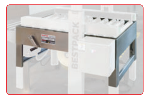
CNC CUT AND WELDED FRAME/LEGS 4x longer lasting than bolted frames.