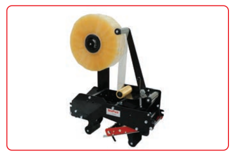
BESTPACK'S AC TAPE HEAD

Increase throughput while reducing strain on the motor.