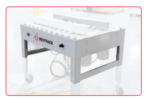
CNC CUT AND WELDED FRAME/LEGS

Convenient technical support is readily available via a QR code on solution.