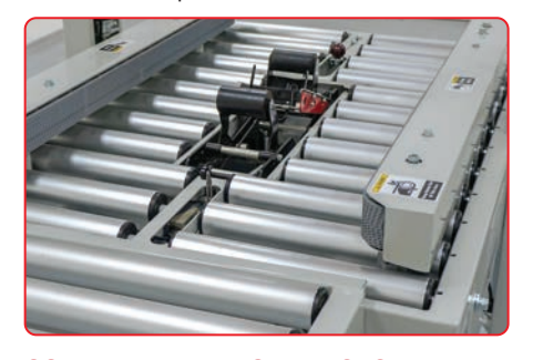
COMPLETE BED ROLLER SYSTEM

Gently pulls product through while reducing less wear & tear on parts.