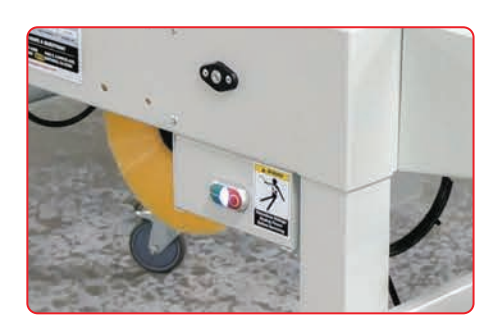
MOUNTING OF ON/OFF ELECTRICAL BOX

Provides flexibilty in workflow process.