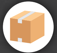
TOP & BOTTOM SEAL