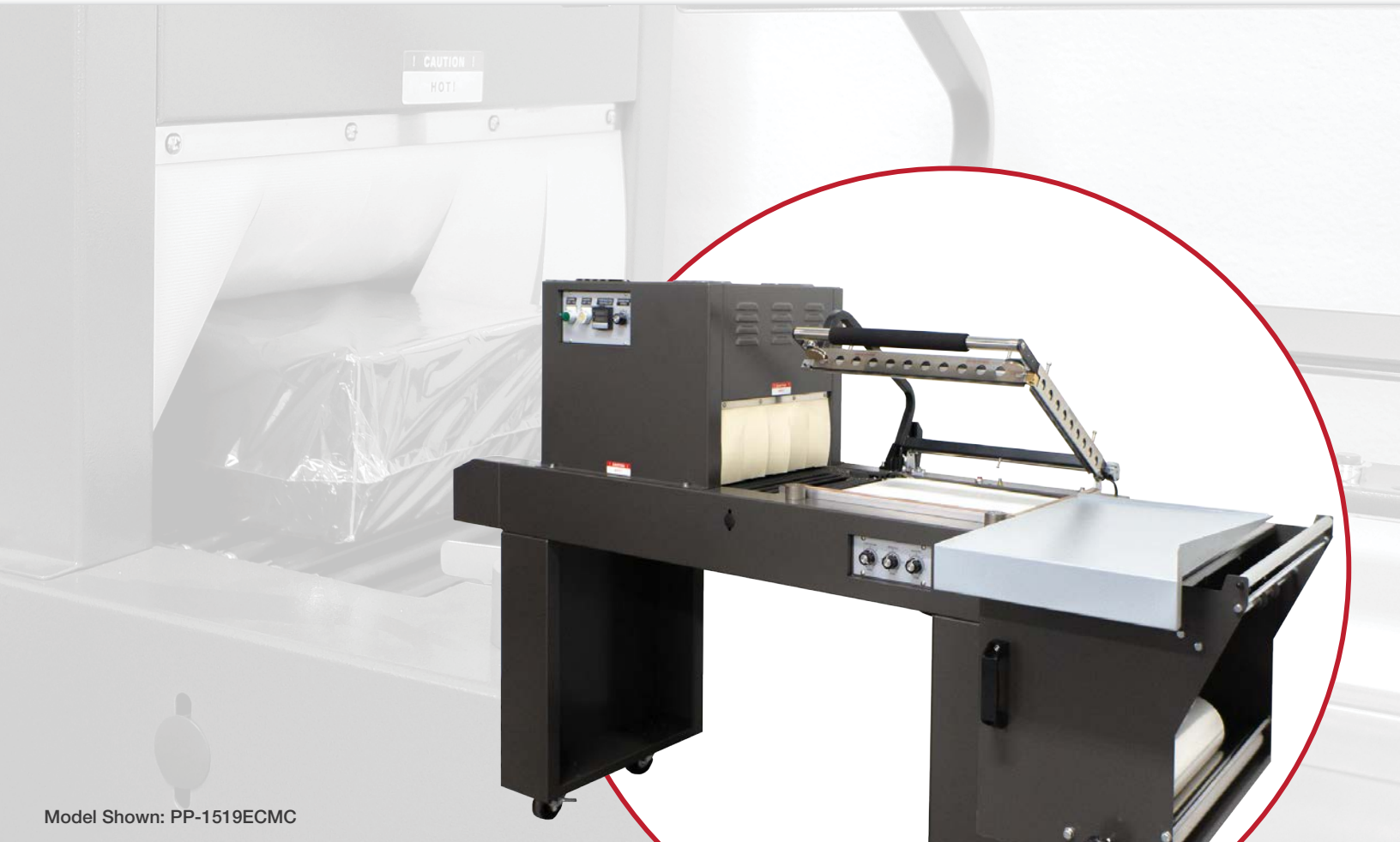
Model Shown: PP-1519ECMC