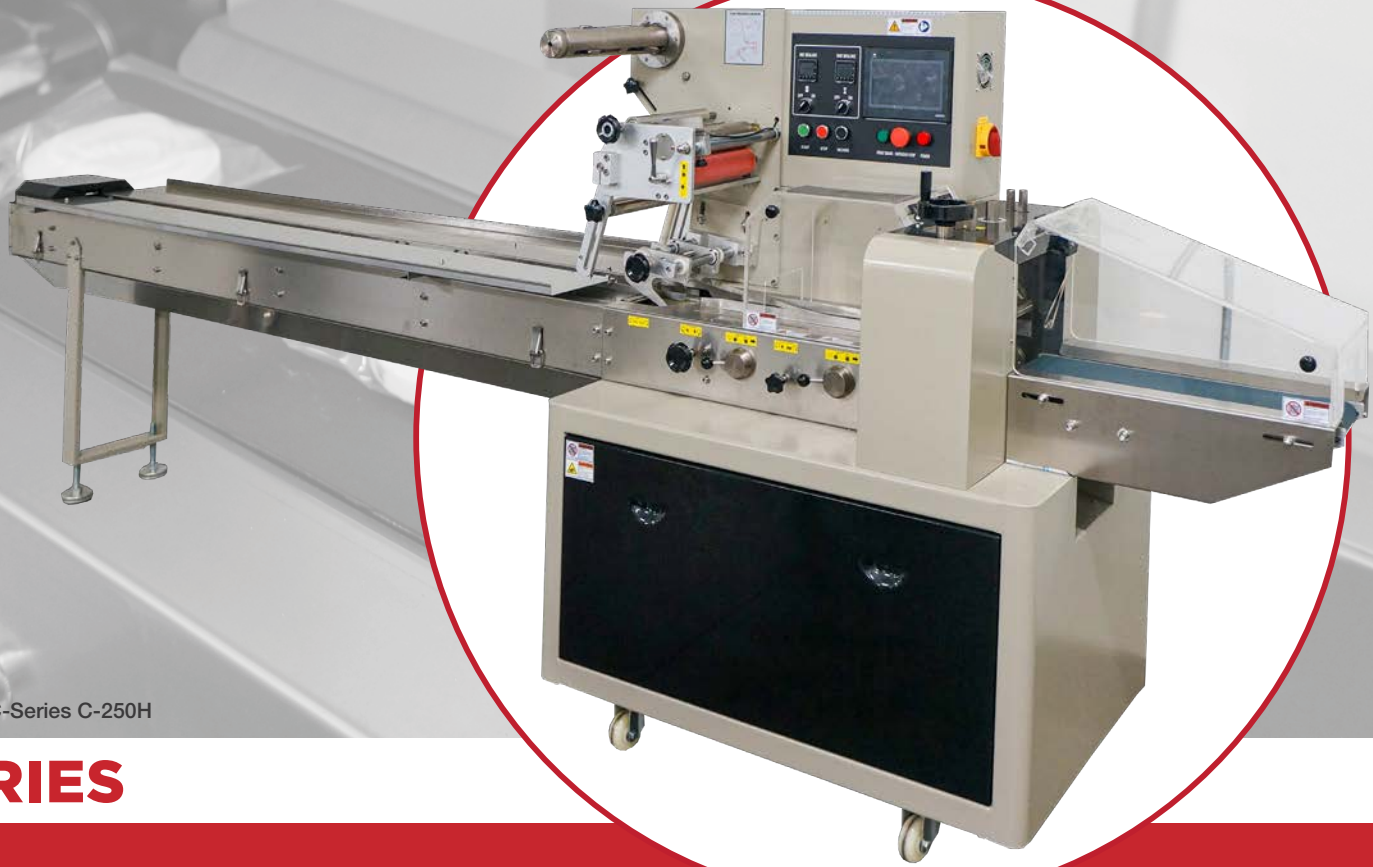
*Model Shown: C-Series C-250H