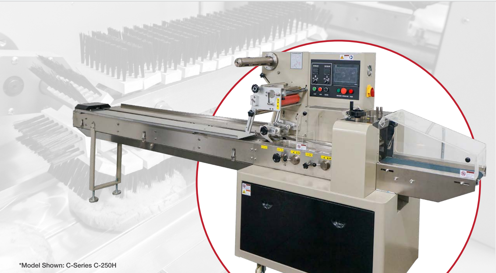
*Model Shown: C-Series C-250H