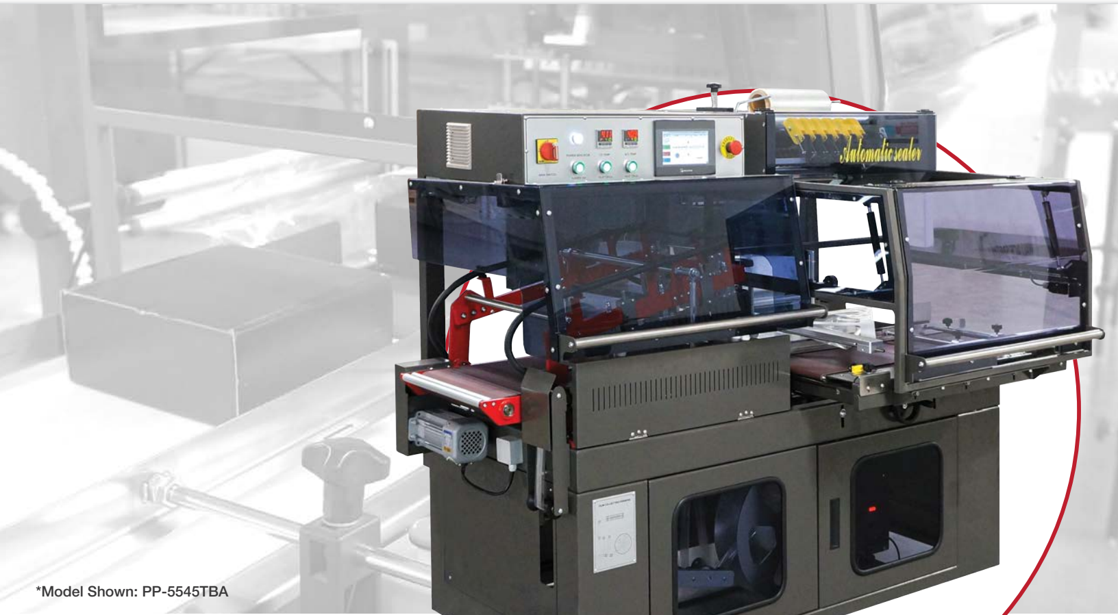
*Model Shown: PP-5545TBA