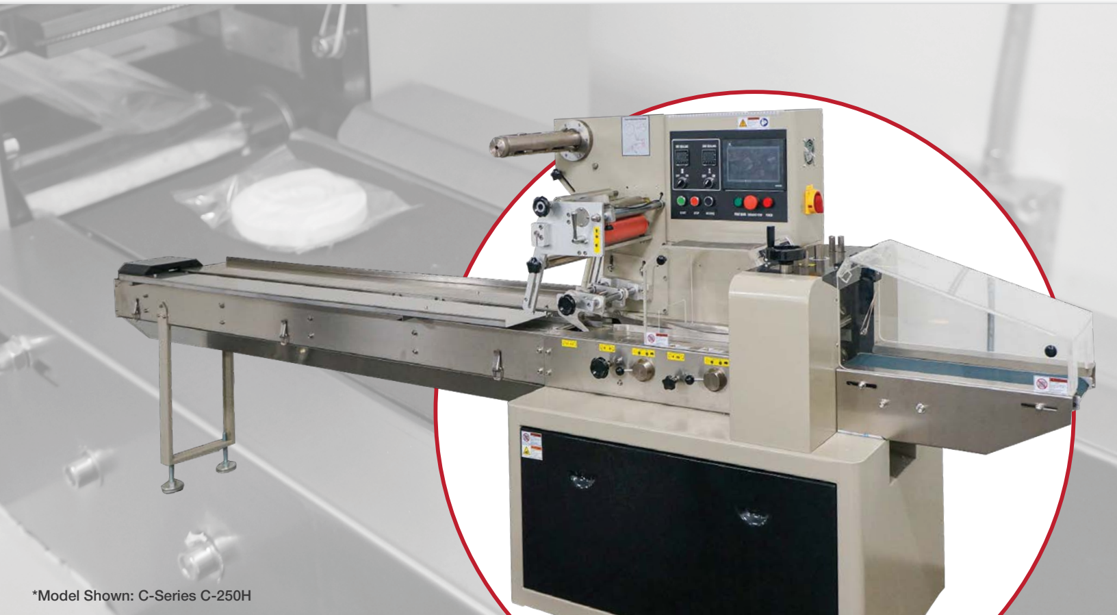
*Model Shown: C-Series C-250H