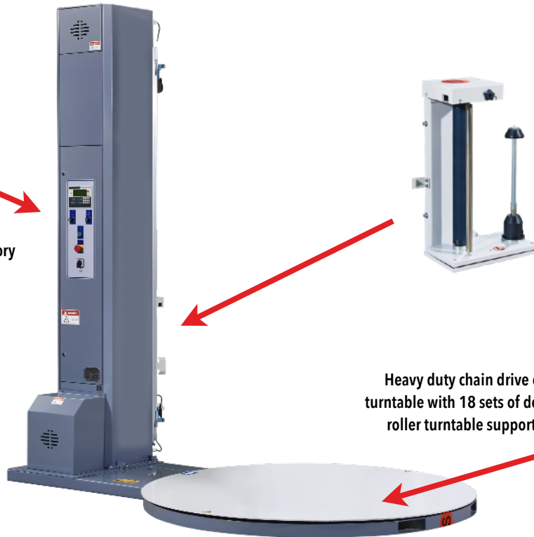
Heavy duty chain drive on turntable with 18 sets of double roller turntable supports.