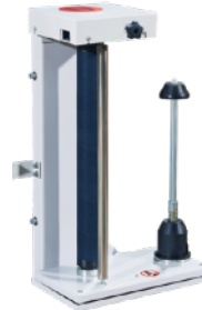
Mechanical brake stretch system designed to offer up to 150% film stretch.