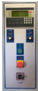
7" Color Touch Screen HMI

Semi-Automatic Mechanical Brake Stretch @ 150%