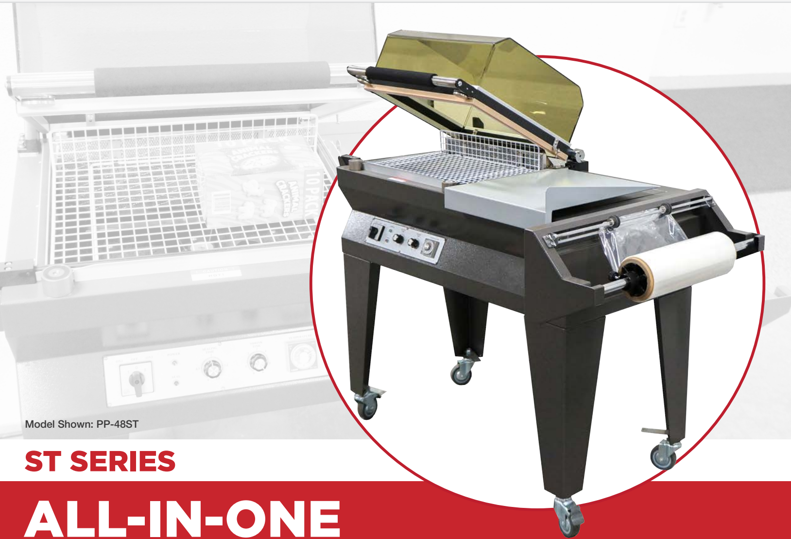
Model Shown: PP-48ST